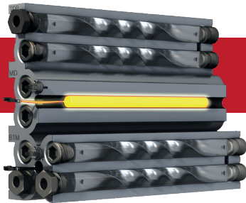
PATENTED HIGH EFFICIENCY ALUMINUM MASS HEATER